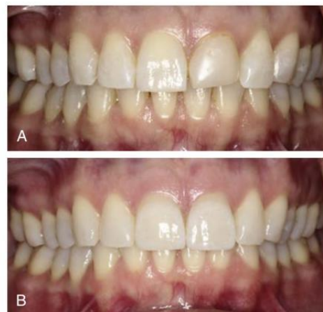
• Fig. 1.1 Restoration of maxillary central incisors with porcelain veneers taking into account esthetics, occlusion, and periodontal health. (Case and photographs courtesy of Michael P. Webberson, DDS, Las Vegas, NV.)

The application of dental anatomy to clinical practice can be envisioned in Fig. 1.1A, where a faulty crown form has resulted in esthetic and periodontal problems that may be corrected by an appropriate restorative dental treatment, such as that illustrated in Fig. 1.1B. The practitioner must have knowledge of the morphology, occlusion, esthetics, phonetics, and functions of these teeth to undertake such treatment.